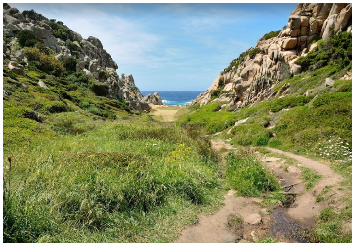
View towards Bocca della Valla (FDG1) from Tetsudo (Tortoise) Pastures (TSG1), passage into the 1 st Valle.