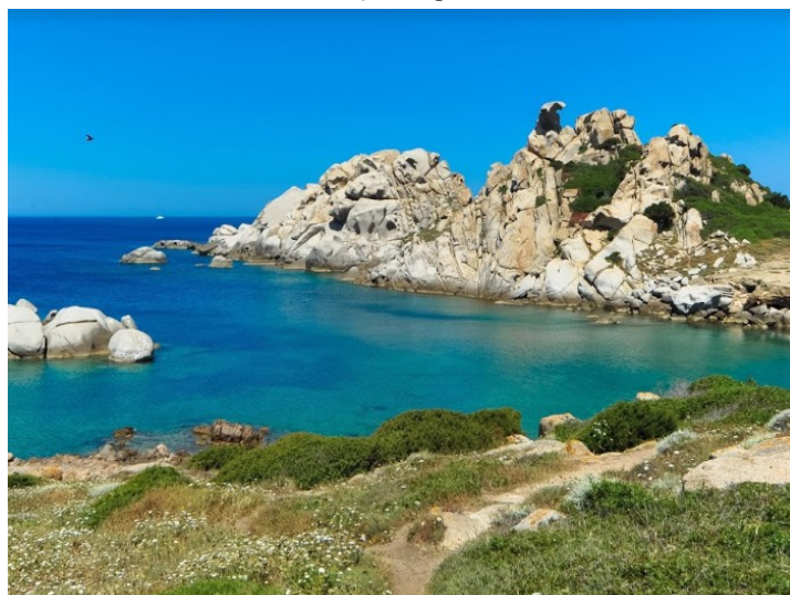
View of Testa dell'Alien (VSC4) from Campo Ricci (RG1).