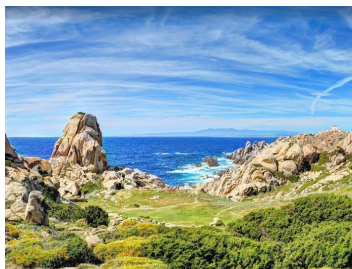
View of Neptues Palace (VSC7)/Goast Pastures (FDG4) from Goatland Gariga (SGG1).

Location 1 st , 2 nd , 3 rd , 4 th , 5 th , 6 th , 7 th , 8 th , 9 th = refers to specific Valle area (see Research Areas Map).